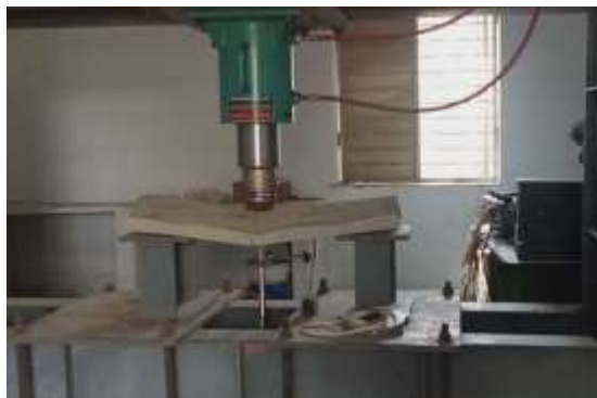
Figure 3. Test setup

The specimen ID was given as follows: The first term represents the shape of the panel. 'T' refers to trough shaped panel and 'F' refers to Folded type panel. The next two terms in the ID refers the type of mesh GI refers to Galvanised Iron mesh and MS refers to mild steel mesh. The number in the ID refers to the number of layers namely one and two layers. The slabs were tested in loading frame as shown in Figure 3.