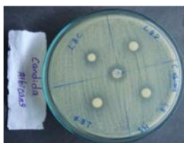
Figure 3. Biological activities of the ligand NABSA and its cobalt, nickel and copper complexes against candida albicans.